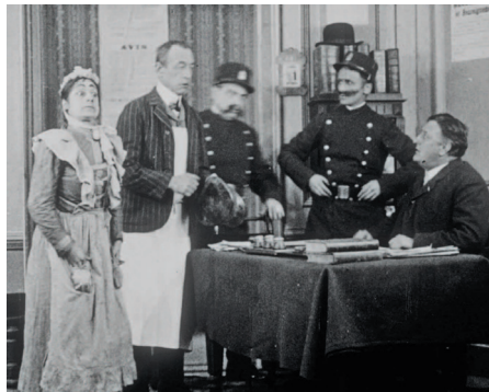
Top: Rosalie and Her Phonograph (1911). Bottom: Cunégonde is a Woman of the World (1912).