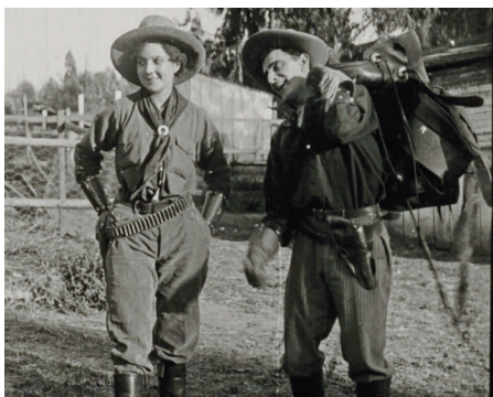
Top: Dollars and Sense (1916). Bottom: A Range Romance (1911).