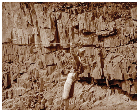
Top: The Girl Spy (1909). Bottom: The Red Girl and the Child (1910).