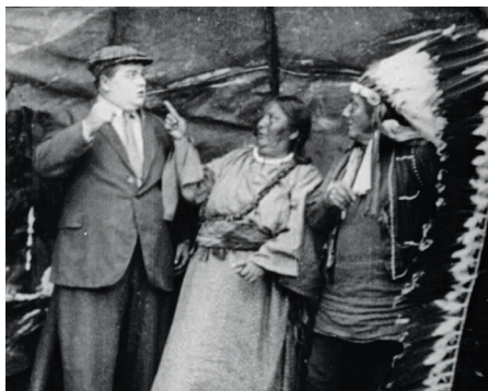
Top: Daisy Doodad's Dial (1914). Bottom: Fatty and Minnie-He-Haw (1914).