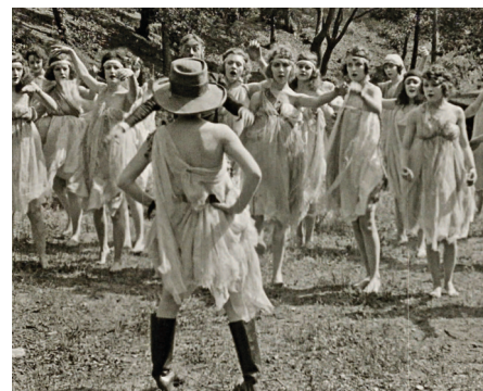
Top: The Adventures of Billy (1911). Bottom: Rowdy Ann (1919).