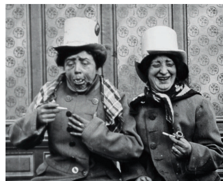
Top: Mary Jane's Mishap (1903). Bottom: The Coachwomen (1907).