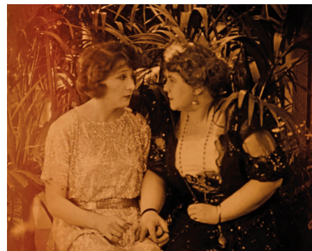
Top: The Boy Detective (1908). Bottom: Taming a Husband (1910).