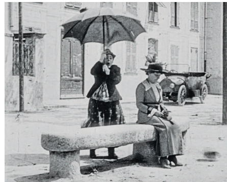
Top: Pétronille Wins the Grand Steeple Chase (1913). Bottom: Zoé and the Miraculous Umbrella (1913).

sions, other modes of masking and passing went disguised. The prevalence and intersectionality of such masking and unmasking should reset our understanding of film history, particularly through the transitional teens. The cinema of the first three decades of the twentieth century clearly had a lot to say about social hierarchies, prejudices, and gender roles and fantasies.