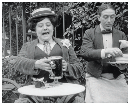
Top: Laughing Gas (1907). Bottom: The Dranems (1912).

striking women are played by poorly disguised men who move around as a delirious mob. As Hennefeld notes in her blurb on the film, despite its ostensible “travesty of working women’s activism, it survives today as an empowering document.”