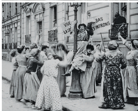
Top: Léontine's Boat (1911). Bottom: The Maids' Strike (1906).